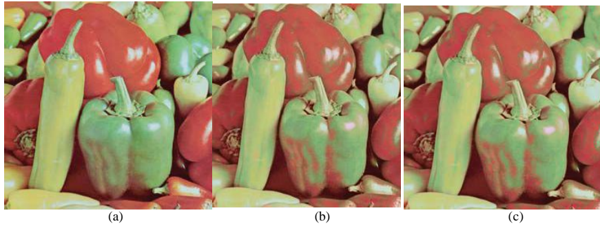
Fig.2 . Experimental results with the 256x256 “Pep” image. (a) Original. (b) SL0. (c) OMP.

In this section, we present the experiments performed on original color image of pepper, butterfly and cap each of size 256x256 using Matlab software. In this experiment at the encoder end original color image is converted in its luminance and chrominance channels. For further process the luminance part is segmented with Multi-scale mean-shift segmentation method. Same procedure is applied at the decoder end for constructing the colorization matrix, at the decoder the RP set from encoder and colorization matrix are used to reconstruct the color image. The original color images and reconstructed color images are shown in the Fig. 2, 3 and 4. Table-1 represent the quality of reconstructed color images based on PSNR, SSIM and MSE parameters.