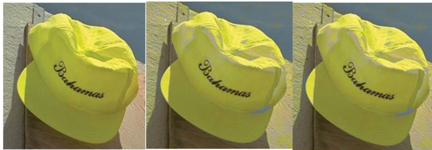
Fig. 3. Experimental results with the 256x256 “cap” image. (a) Original. (b) SL0. (c) OMP.