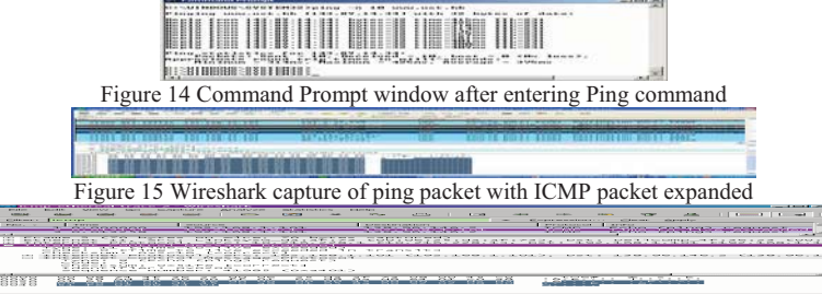
Figure 16 Wireshark window of ICMP fields expanded for one ICMP error packet.

At the end of the experiment, your Command Prompt Window should look something like Figure 6.1. In this example, the source ping program is in Massachusetts and the destination Ping program is in Hong Kong. From this window we see that the source ping program sent 10 query packets and received 10 responses. Note also that for each response, the source calculates the round-trip time (RTT), which for the 10 packets is on average 375 msec.