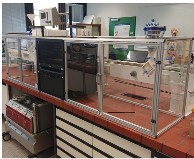
Figure 3: Test Set Up of the DeLiver System

At present, a suitable casing has been designed and constructed for the test set up (see figure 3), an automatic temperature regulation system has been designed and a suitable pump has been integrated. The next step is to research an oxygenation concept that satisfies the oxygen demand of the liver. The findings from the research project MemO2 can be used for this purpose [11]. The DeLiver system has special requirements for oxygenators that will be used. It cannot exceed a certain size nor lead to damage of blood components due to narrow lumen. However, since the system works with lower pressures and volume flows than conventional oxygenators, the possible options need to be determined and assessed. Furthermore, a suitable container for the liver must be designed and manufactured.