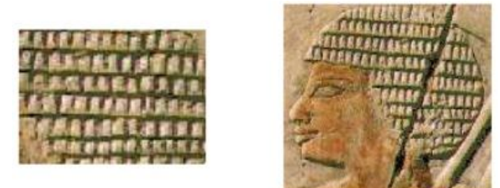
Figure 2. Texture feature in CBIR