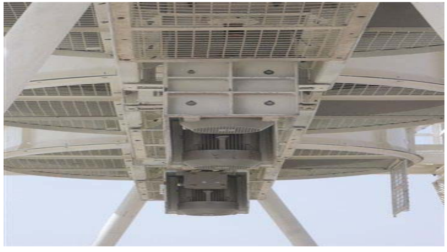
Air Cooled Heat Exchanger Photograph