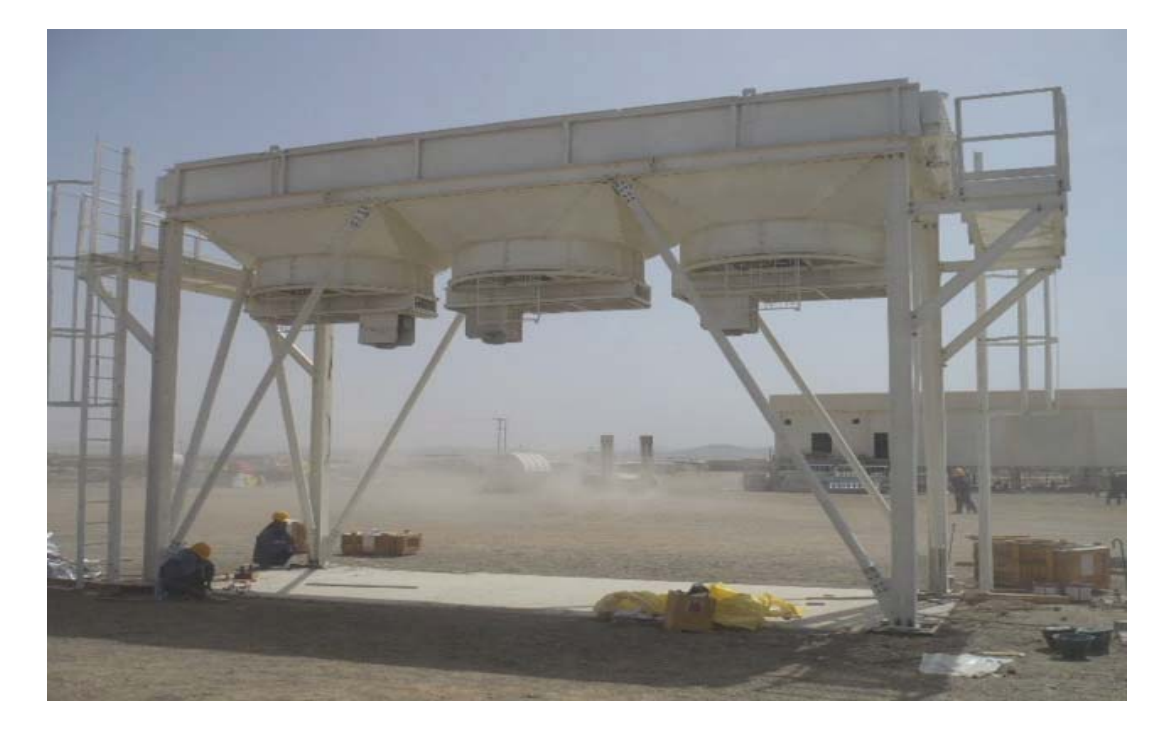
Air Cooled Heat Exchanger Photograph